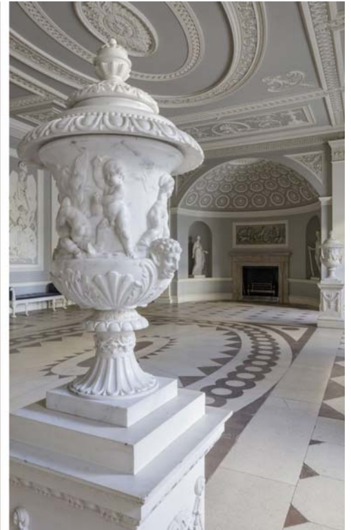
THURSDAY, 26 OCTOBER