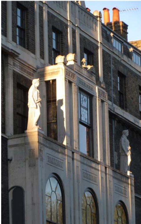
MONDAY, 25 SEPTEMBER