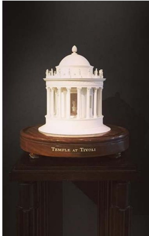
TUESDAY, 26 SEPTEMBER