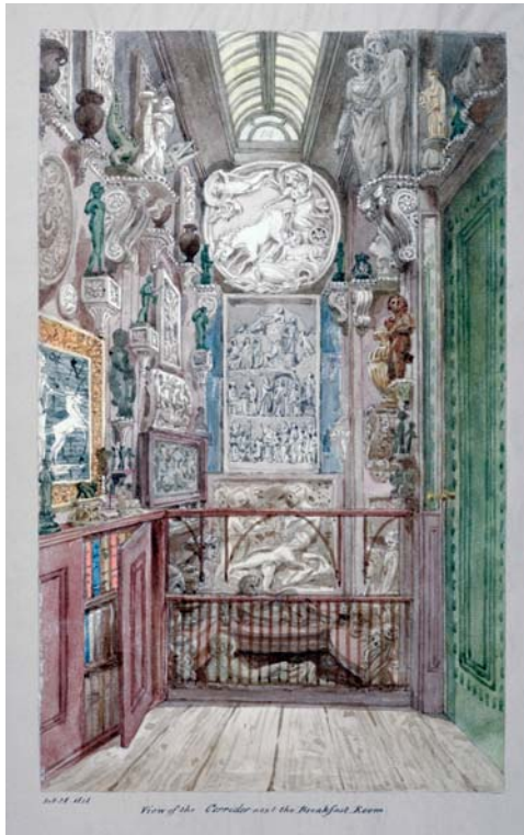
1826 View of the Corridor and the Breakfast Room