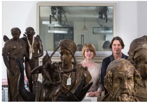
View of the Lobby of the Breakfast Room, 1826. Watercolor: J.M. Gandy